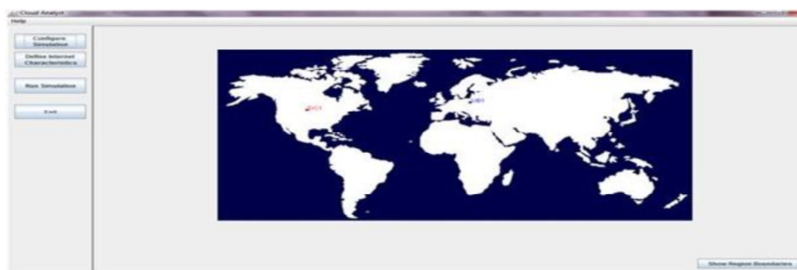
Figure 1. Cloud Analyst Main GUI Window

CloudAnalyst Simulator: Cloud computing provides computing resources as a service over a network. As speedy function of this emerging technology in real world, it becomes more and more vital how to evaluate the performance and trust management problems that cloud computing confronts. Currently, modeling and simulation technology has become a useful and powerful tool in cloud computing research community to deal with these issues.